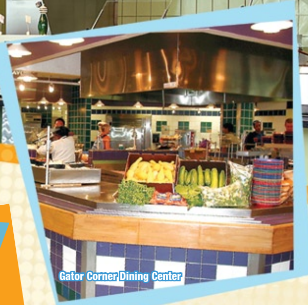
Gator Corner Dining Center